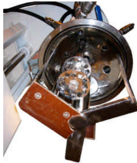
View of low-speed and twin high-speed blades Note domed cover with o-ring seal