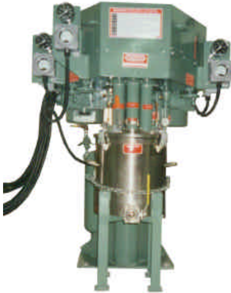
VL550/500 Vacuum Tri-Shaft Mixer