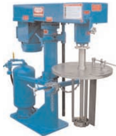
Figure 5. High-Speed Rubber Cutter