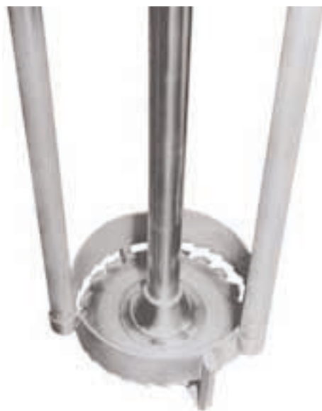
Figure 2. Single-Shaft Blade

to accomplish the end result with low temperatures and little evaporation or loss of solvents due to long process or batch cycle times.